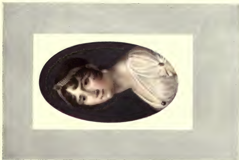
THE EMPRESS JOSEPHINE BY JEAN BAPTISTE ISABEY